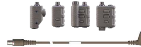
Download to INVISIO control unit 701768-001