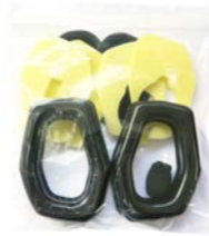
Hygiene kit 701675-002 - Black