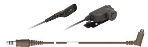
Download to TP120 for U94 PTT 701772-001 (U94 available in US only)