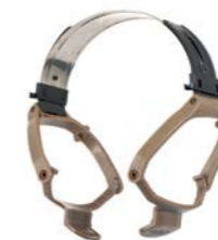
Headband 701276-002 - Coyote Brown