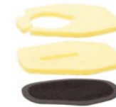
Earcup foam/gauze (pair) 701599