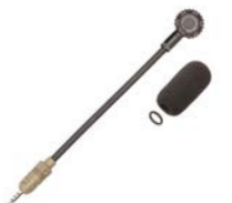
Boom microphone assembly 701604-001 - Tan