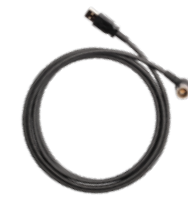
USB cable 701282