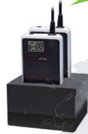
2-slot desk charger