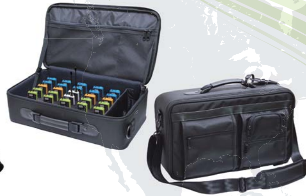
35-slot charger carry case