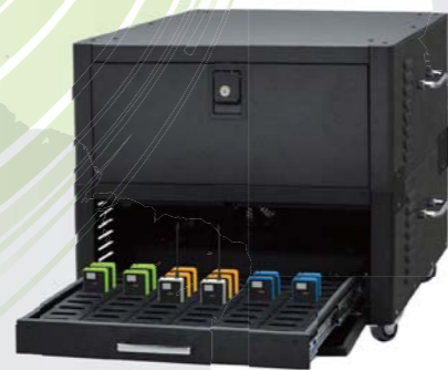
60-slot charger drawer