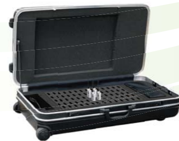
70-slot charger trolley