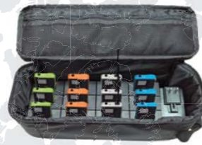
12-slot charger hand bag