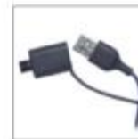
USB-A / USB-C ADAPTER