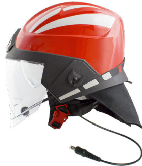
FIRE & RESCUE SOLUTIONS