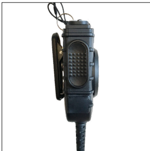
Large side PTT and 3,5mm listen only jack socket