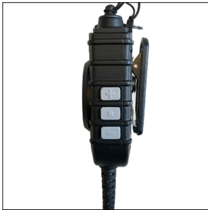
Volume +/- and loudspeaker mute side buttons

With two large Push-To-Talk buttons, enhanced control buttons and IP67 protection rating, the Titan MM50 is the must-have Remote Speaker Microphone for first responders. The Nexus and 3.5mm jack sockets makes headset integration easy and is the ideal solution for users needing to connect helmet audio systems with a portable radio.