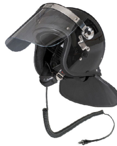
PUBLIC SAFETY SOLUTIONS