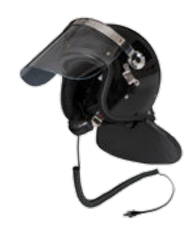
PUBLIC SAFETY SOLUTIONS