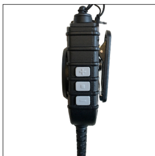
Volume +/- and loudspeaker mute side buttons

With two large Push-To-Talk buttons, enhanced control buttons and IP67 protection rating, the Titan MM50 is the must-have Remote Speaker Microphone for first responders. The Nexus and 3.5mm jack sockets makes headset integration easy and is the ideal solution for users needing to connect helmet audio systems with a portable radio.